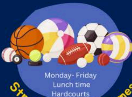
Structured Yard Games