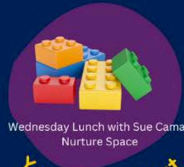
Year 2-6 Connect