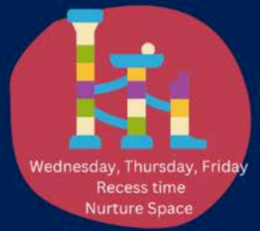
Build and Play