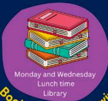
Bookbites and Drawing