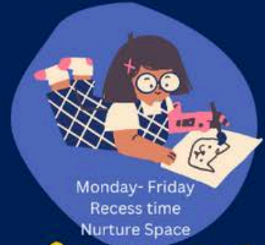
Quiet Inside Play