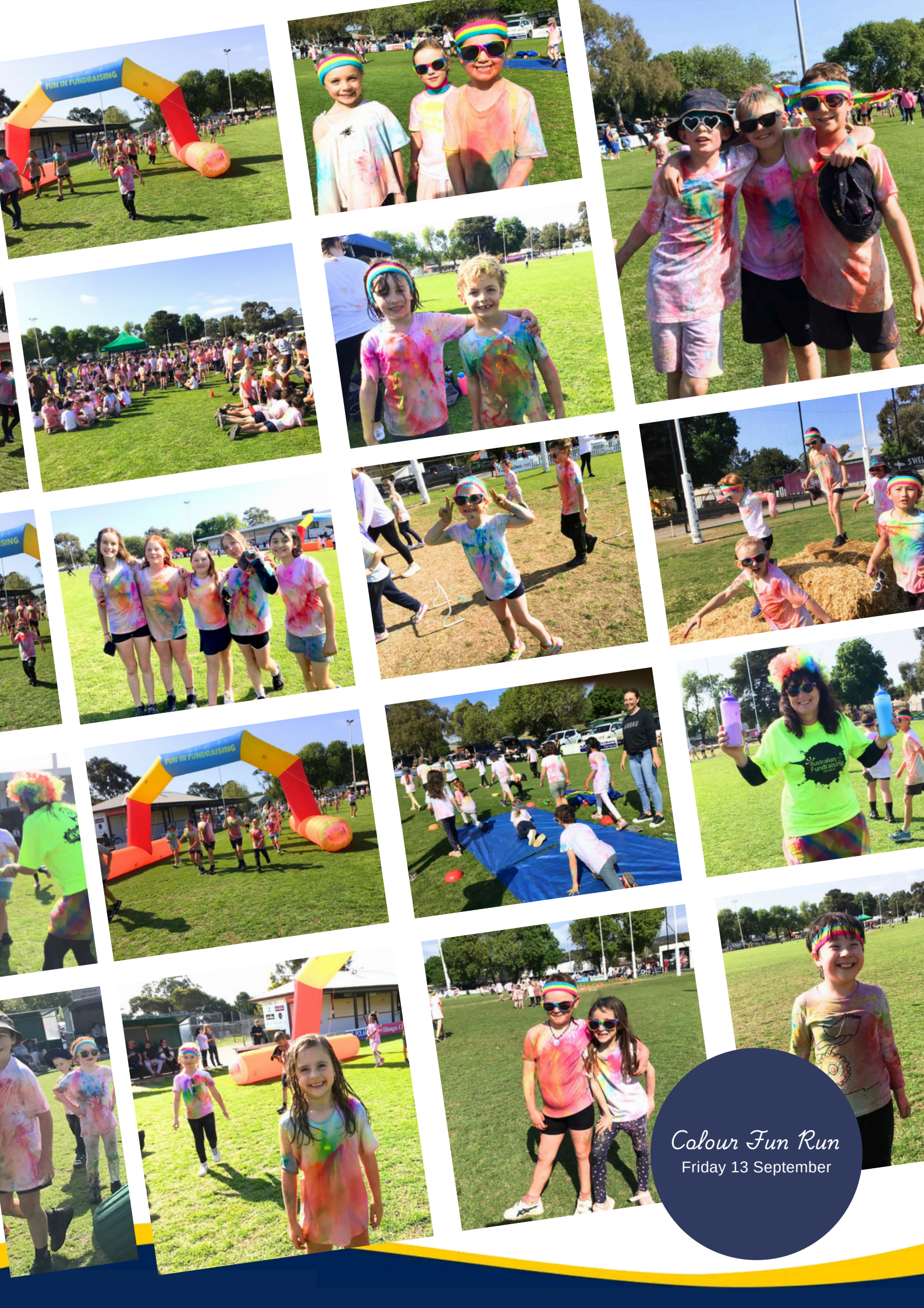
Colour Fun Run Friday 13 September